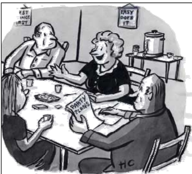
Grapevine Cartoon Contest Winner April 2013

I invite you to join me on a journey through our literature that will begin in earnest with the next issue of the Seeds of Service.